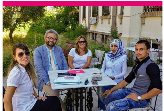
Photograph taken prior to March, 2020

HIAS protects and supports refugees to build new lives and reunite with family members in safety and freedom. The primary goal of HIAS’s work in Greece is the provision of high quality public legal information and representation to refugees with a focus on those who are most vulnerable, such as children and survivors of torture or gender-based violence (GBV). With little legal help available for refugees and asylum seekers across Greece, HIAS plays a critical role helping refugees secure legal status, the first step toward regaining control and stability in their lives.