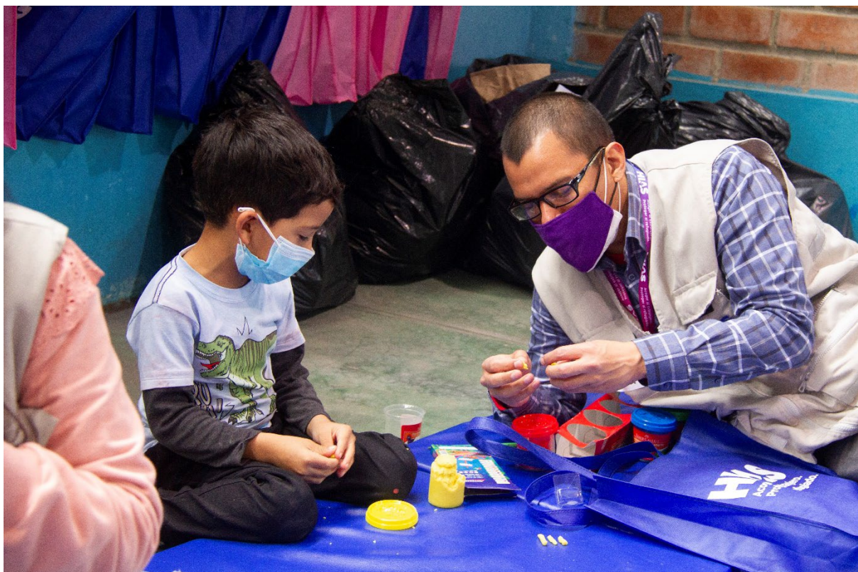
A refugee child in Lima plays in a welcoming space for children while his parents receive information and services from HIAS.

HIAS is also committed to developing an effective, sustainable safety and security risk management system that is in line with our values, mission, and our organizational duty of care. HIAS Peru will adapt its safety and security approach with new training and tools as programming expands to different locations. HIAS Peru will continue to emphasize preventive security strategies and early detection of risk. HIAS Peru will continue to strengthen existing tools and policies such as the acceptance strategy and continually update the overall safety and security management plan. HIAS Peru's security focal point and the regional and headquarters-based Safety and Security Department work together with the Country Director and program teams to ensure that the measures in place enable programming while cultivating organization-wide compliance. HIAS Peru will continue to monitor the security climate in all high-risk locations and respond accordingly to changes in the security climate in areas where HIAS has operations and programming. For all new offices, such as in the Tumbes border region, a security assessment will be carried out to identify potential gaps and take measures to address them.