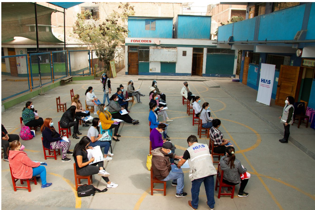
Community members in Lima receiving information from HIAS and learning about opportunities to receive additional services.

Operational since 2019, HIAS Peru serves Venezuelan refugees, migrants, and asylum seekers with comprehensive interventions that support their ability to safely integrate into host communities. HIAS Peru works in the areas of highest need including the cities of Lima, Callao, Tumbes, Chiclayo, Ica, Piura, and Trujillo. HIAS realizes people carry a diversity of experiences and intersecting identities requiring unique support and solutions. As such, HIAS takes a holistic approach to its interventions and offers integrated programming in GBV prevention and response, community-based mental health and psychosocial support, economic inclusion, and legal protection. In 2021, HIAS Peru served approximately 90,000 Venezuelans with these critical services.