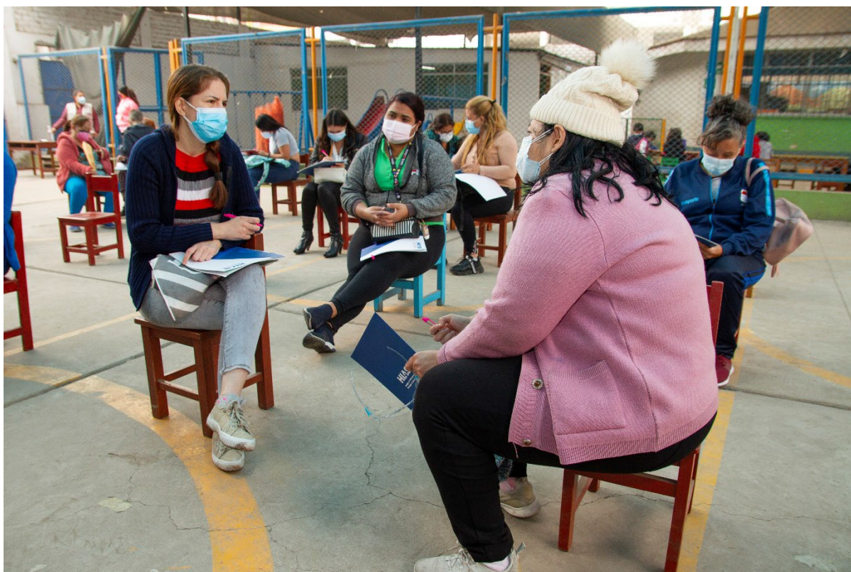
HIAS clients in Lima discussing protection concerns with one another.