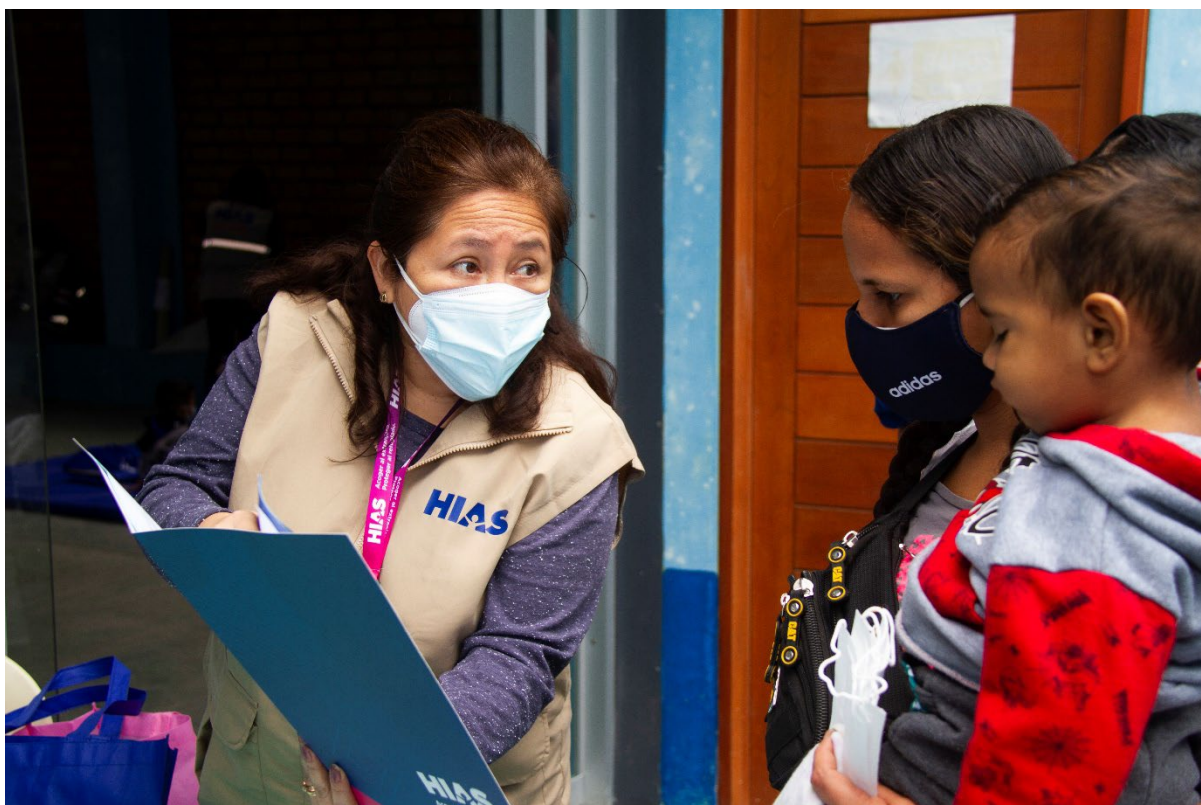
HIAS staff in Lima providing information to clients about HIAS services and available resources in the community.