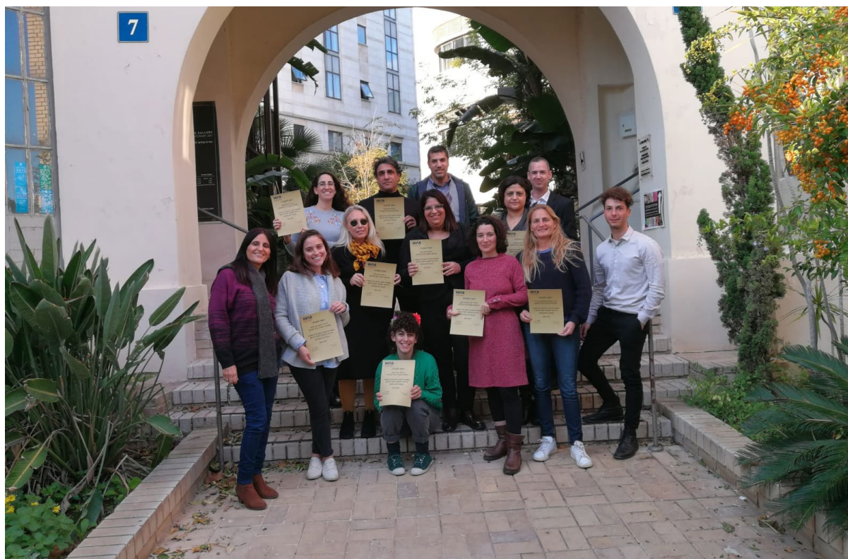
HIAS Israel law fellows in training, August 2020.

The HIAS Israel team is comprised of 13 staff located in Tel Aviv. HIAS Israel's Country Director, Deputy Director, and project coordinators make up the leadership team. Each HIAS Israel staff member abides by HIAS' Code of Conduct and other HIAS policies and procedures in line with global best practices. All staff members have completed trainings on Protection from Sexual Exploitation and Abuse (PSEA) . These trainings are updated and repeated regularly to ensure both prevention and response to any reported incidents of SEA. HIAS applies a gender lens when analyzing, planning, and making decisions across all its operations, in order to ensure the safety, security, and wellbeing of the entire organization's staff.