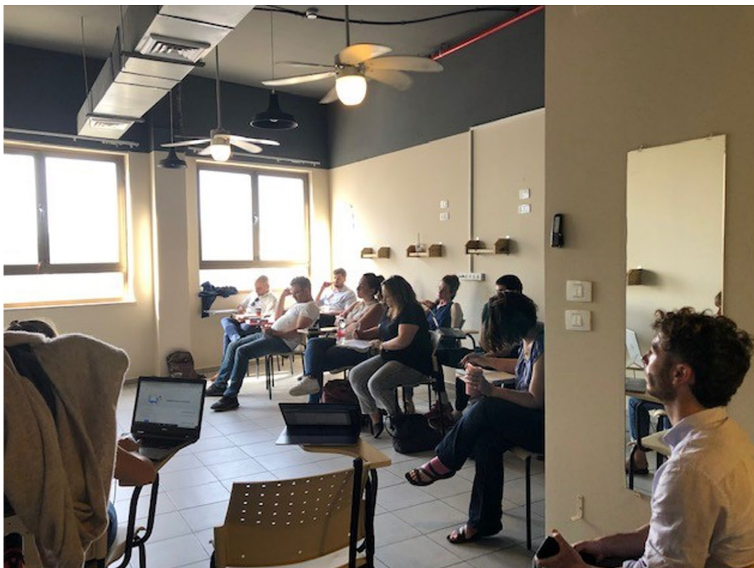
HIAS Israel law fellows in training, August 2020.

HIAS staff are subject to a robust Code of Conduct and set of internal policies, including PSEA, Non-Discrimination and Anti-Harassment, Conflict of Interest, Privacy, Whistleblowing, Security and Emergency Preparedness, Information Security, Data Breach, Finance and Accounting, as well as others relating to procurement, travel, and reimbursements.