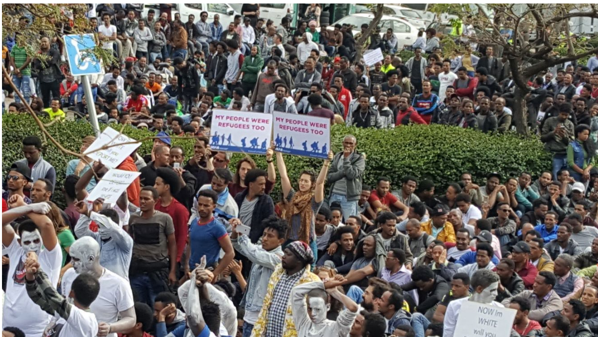
Demonstrators, including HIAS Israel staff, in Tel Aviv protesting the deportations of African asylum seekers in March, 2018.

In 2014, HIAS Israel created and now maintains a network of pro bono lawyers and students that can provide legal aid to asylum seekers and refugees. HIAS Israel has built the capacity of more than 200 attorneys to assist over 1,300 clients in 2019-2021, increasing the pro bono assistance available to asylum seekers in Israel by over 600%. HIAS Israel also served over 2,000 asylum seekers in those years through legal counseling, information sessions, and paralegal support. HIAS maintains a success rate of over 90% in legal cases, secured residency permits for at least 90 individuals over the last three years, and successfully initiated strategic litigation that challenged policy and had a broader impact on the refugee community in Israel. HIAS is the only NGO in Israel that offers pro bono legal representation to asylum seekers regarding family law issues.