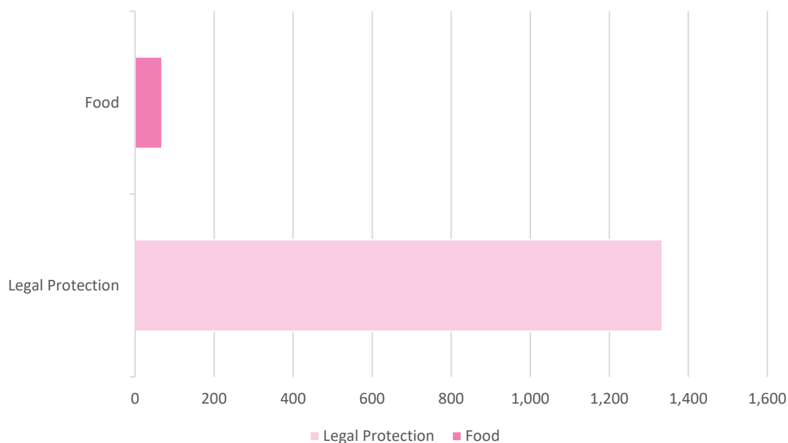
Graph 2: People Reached by Program Area in 2021