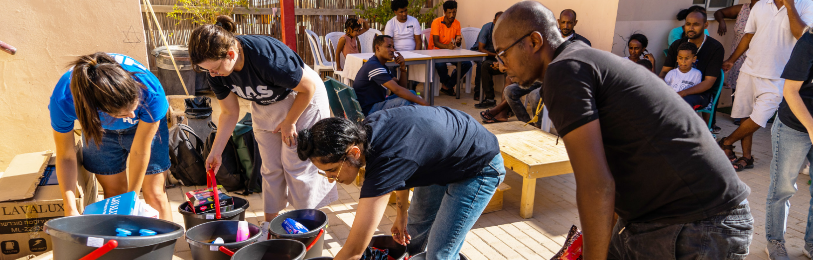
HIAS staff, along with community volunteers, organize items during an emergency food and non-food item distribution for a displaced Eritrean asylum-seeking community in Nitzana, Israel, on October 26, 2023.