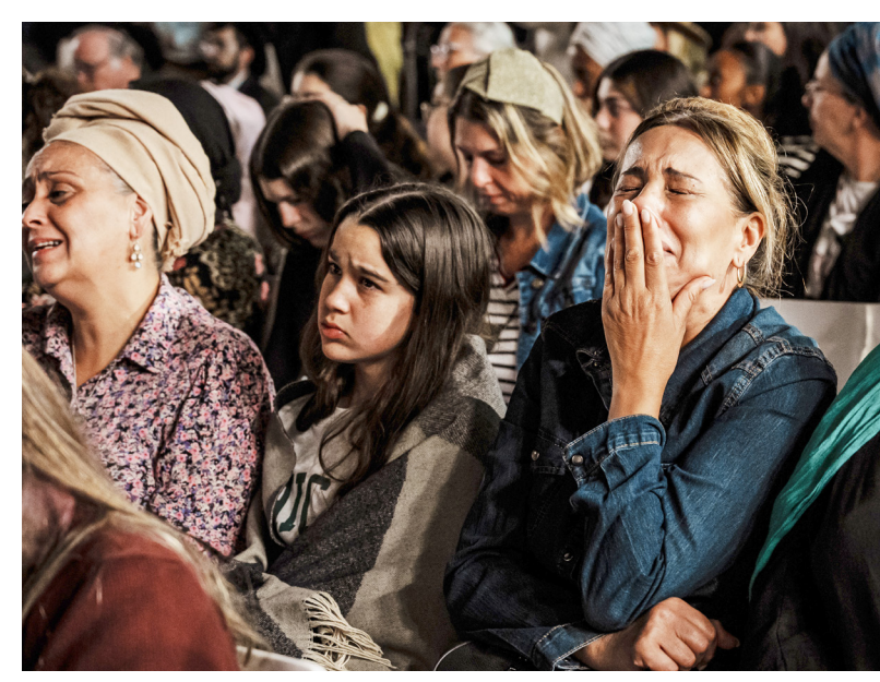
A woman weeps during special presentations and eulogies to honor the 1,200 Israelis killed and to mark the 30th day since the Oct. 7 Hamas assault on communities near Gaza, during a special candlelight vigil ceremony at the Western Wall in the Old City in Jerusalem, Nov. 6, 2023.

rapid onset emergencies, there is a swell of communityorganized services and support for those displaced, however, more sustainable solutions are needed as teams prepare for the days and weeks ahead.