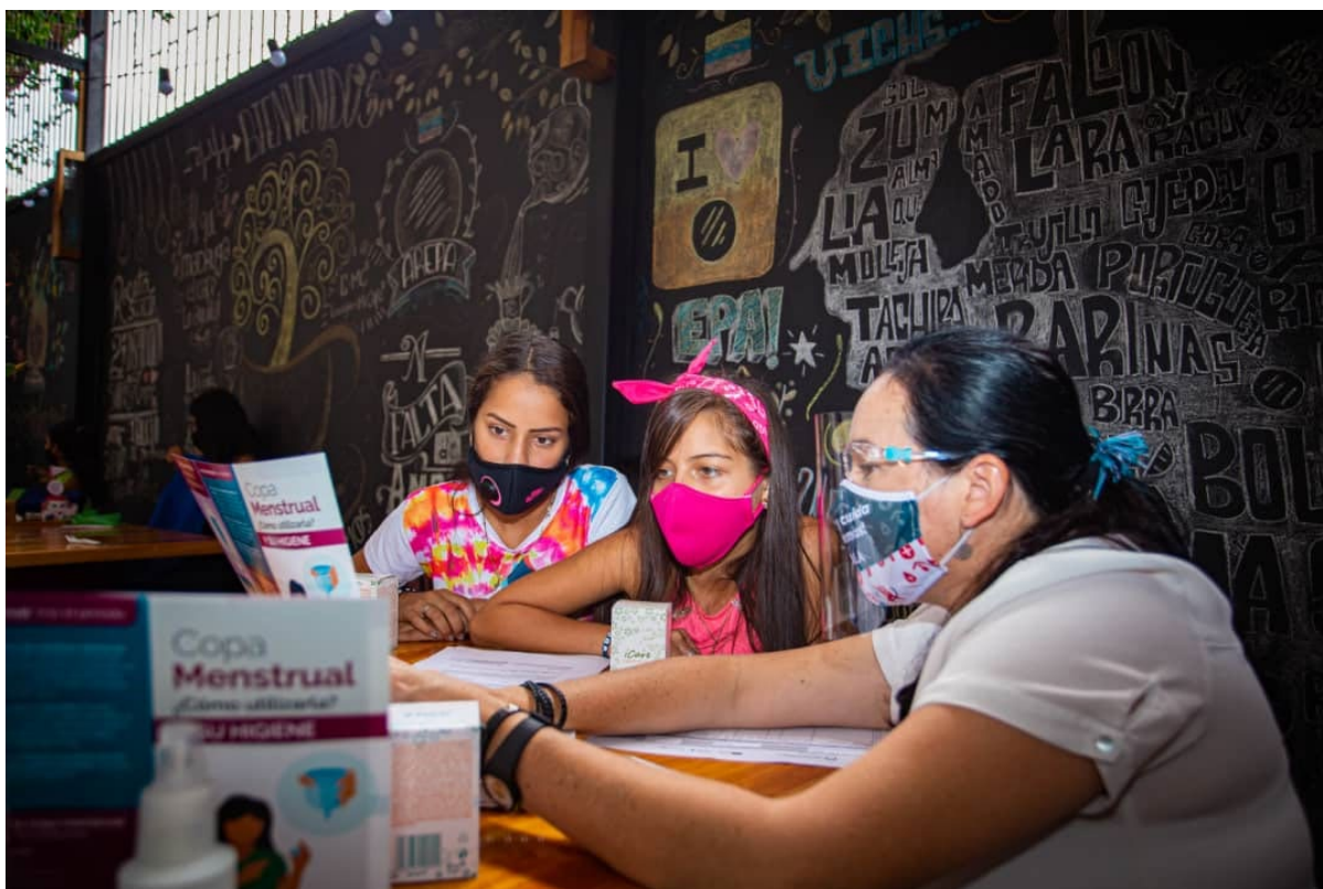
Participants in the Empowerment Curriculum Model for Girls and Adolescents discussed and learned about menstruation and menstrual hygiene and received menstrual cups, a method of menstrual hygiene that is environmentally friendly and helps to minimize costs.

HIAS Venezuela's economic inclusion programs provide opportunities for refugees and host communities to build independent and meaningful futures that allow them to enhance their self-reliance and increase their resilience, including training to improve their nutrition, budget planning, and safe use of electronic payment mechanisms. In addition, HIAS is strengthening the resilience and livelihoods under a focus on protection of some indigenous populations inside Venezuela, through providing technical assistance, training, advice and delivery of basic supplies and materials for production, as well as supplies to meet the immediate needs of the most vulnerable indigenous populations, increasing the resilience and quality of life of these communities. These activities are coordinated with respect as well as a desire to strengthen the capabilities, traditions, and ways of life of each community.