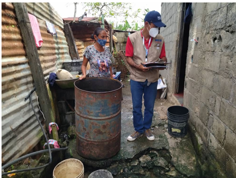
A HIAS community worker, conducts a baseline assessment to identify the needs of the target population in the Zulia State, in September 2021.

community members in each project location to serve as reference groups for project activity implementation, creating a link to the community and ensuring that all affected populations can access services.