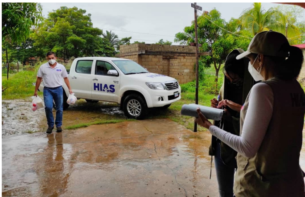
HIAS case workers in the Zulia state deliver food assistance to a survivor of GBV in November 2020.

HIAS Venezuela works closely with UNCHR and its partners and will continue to collaborate with international NGOs, local organizations, the private sector, and other key stakeholders supporting refugees and asylum seekers. HIAS Venezuela participates in national and regional humanitarian coordination working groups, shares programming data and assessments, and coordinates responses to gaps and emerging needs. At the national level, HIAS Venezuela participates in all the clusters established through the Humanitarian Response Plan as well as coordination spaces led by OCHA and the Forum of International Humanitarian Organizations in Venezuela. HIAS Venezuela also works closely with the National Commission for Refugees (CONARE) in Venezuela. HIAS Venezuela will continue to strengthen partnerships with local organizations including women-led groups to deepen and sustain impact.