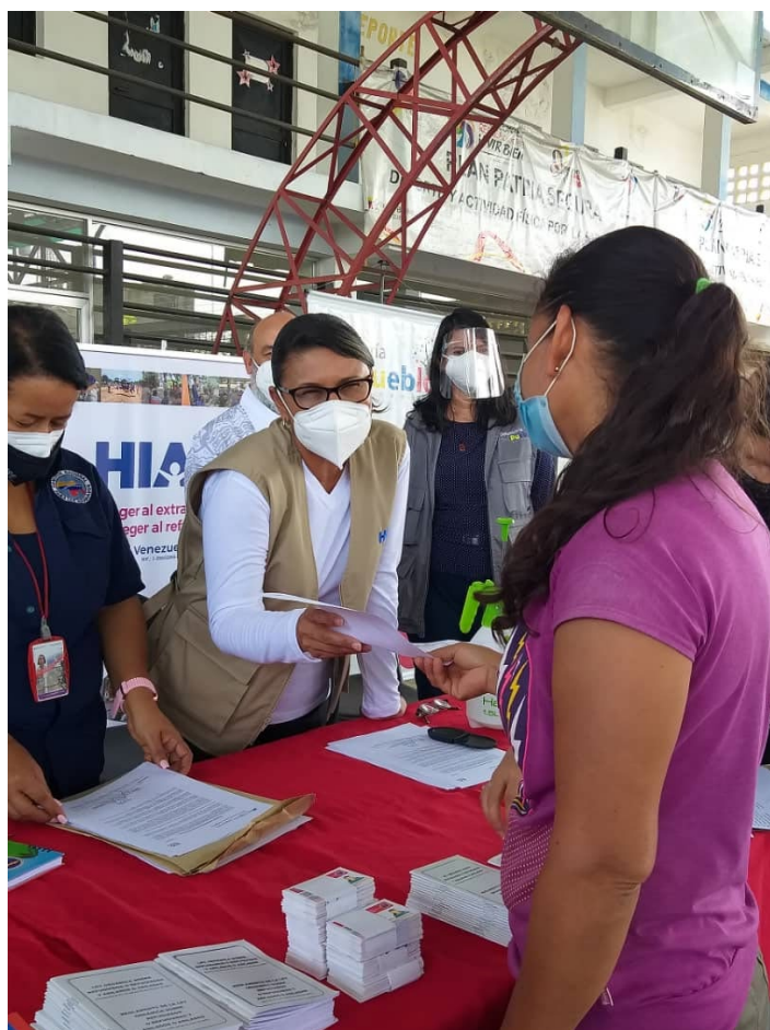
HIAS staff delivering Refugee Status Determination documents to participants in May 2021.

The HIAS Venezuela team is comprised of expert staff working across different locations. The Country Director leads a Senior Management Team made up of key senior staff. Each HIAS Venezuela staff member abides by HIAS' Code of Conduct and other policies and procedures in line with global best practices. All staff members have completed trainings on Protection from Sexual Exploitation and Abuse (PSEA) . These trainings are updated and repeated regularly to ensure both prevention and response to any reported incidents of SEA. HIAS applies a gender lens when analyzing, planning, and making decisions across all its operations, to ensure the safety, security, and wellbeing of the entire organization's staff.