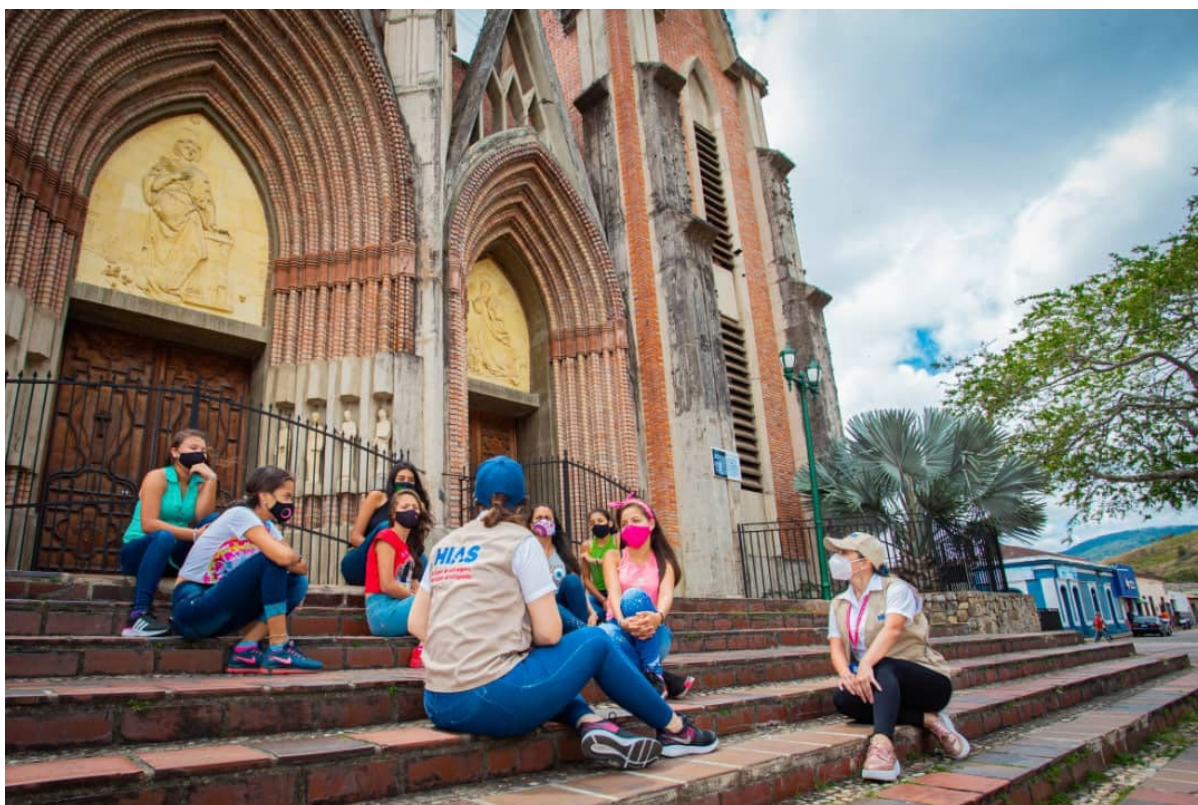
A group of adolescent girls participated in an interactive session together with HIAS case workers and training facilitators in February 2021.

Venezuela's deteriorating infrastructure has led to insufficient access to clean water and adequate sanitation systems across the country. To mitigate these disruptions, HIAS and its partners have designed and implemented water, sanitation, and hygiene (WASH) programs in eight states in Venezuela. Activities include providing communities with access to clean water through rehabilitation of access sources, education on good hygiene, dignity kits containing menstrual hygiene products and other products for women and girls, and delivery of sanitation supplies. In addition to hygiene and maternity kits, HIAS Venezuela also provides household and emergency kits.