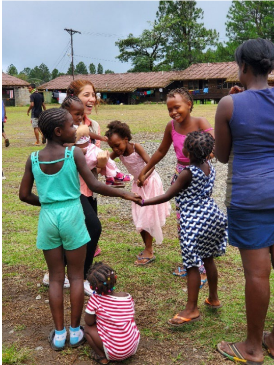
HIAS MHPSS staff participating in integration activities with program participants in Los Planes De Gualaca, Chiriqui.

Compact on Refugees. At the national level, HIAS Panama co-leads the gender and GBV working group with UNHCR, and also participates in working groups on health and protection. HIAS Panama has also signed MOUs with the municipality of Chorrera and with the National Institute of Women (INAMU). HIAS Panama also works closely with Capital Bank, Banco Pichincha, Quality Leadership University, who provide internship opportunities for refugees and migrants.