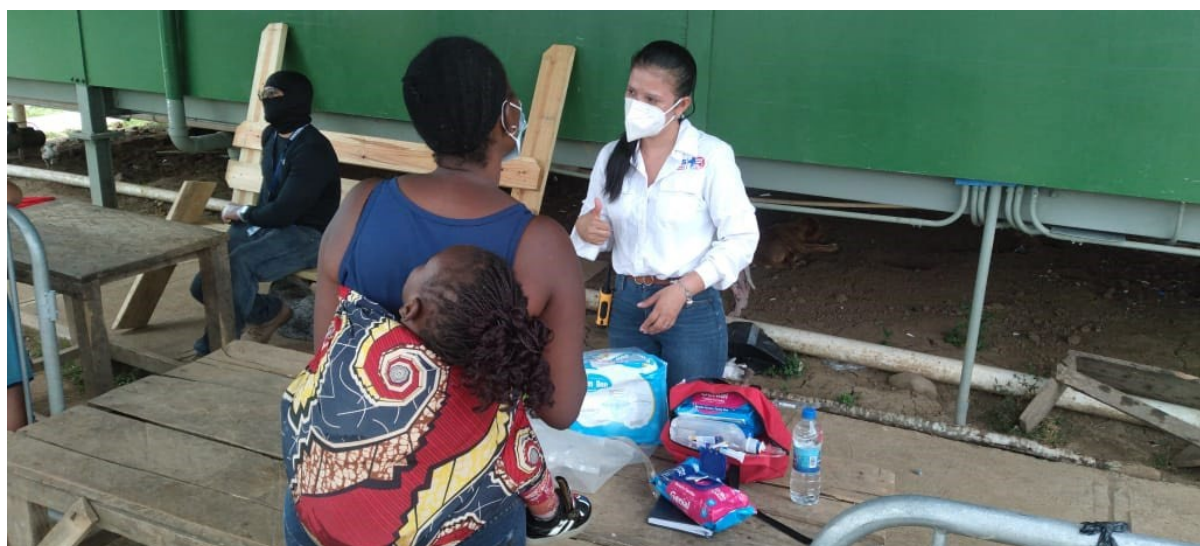
HIAS staff providing information to vulnerable migrants and refugees in Canaan Membrillo in the region of Darién.

With support from headquarters (including the regional office), HIAS Panama will also continue to review and strengthen procedures and tools related to data and reporting as well as finance and compliance, in line with donor requirements and international standards. HIAS Panama will work with headquarters to establish an Enterprise Resource Planning (ERP) system. The ERP will improve alignment of operations, finance, programs, and human resources, allowing for more efficient and cost-effective country operations.