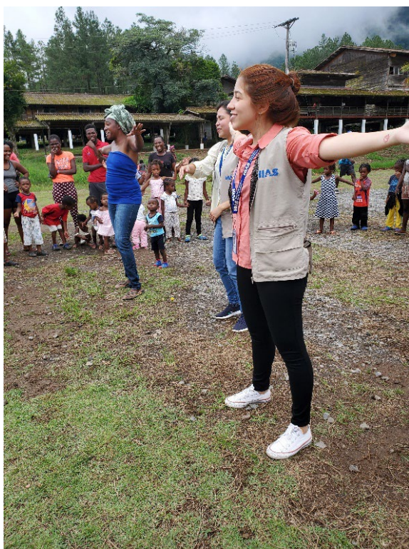
HIAS MHPSS staff leading participants in an activity at the migration center in Los Planes De Gualaca, Chiriqui.

Operational in Panama since 2010, HIAS' programs support refugees, asylum seekers, and vulnerable migrants access protection and build new lives. HIAS Panama's programs reach marginalized people including women and girls, GBV survivors, LGBTQ individuals, the elderly, and people with chronic diseases. HIAS Panama adopts a community-based approach across its programs, promoting the wellbeing of host communities and strengthening the capacity of local leaders. HIAS realizes people carry a diversity of experiences and intersecting identities requiring unique support and solutions. As such, HIAS takes a holistic approach to its interventions and offers integrated programming in GBV prevention and response, community-based mental health and psychosocial support, economic inclusion, and legal protection. In 2021, HIAS Panama reached over 10,000 program participants with comprehensive services.