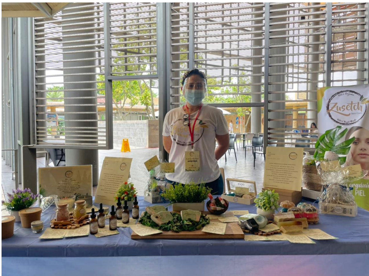
A participant in HIAS' entrepreneurship program presenting at an entrepreneurship fair during the commemoration of World Refugee Day, 2021, in Panama City.

HIAS Panama's comprehensive GBV prevention and response programming prioritizes survivors' leadership when designing and implementing activities. HIAS Panama provides case management, MHPSS services including support groups, and refers survivors for additional health and legal protection services that enable them to recover, heal, and thrive. Through risk reduction activities, such as through community protection gatherings, HIAS Panama works to mitigate the threats to women and girls that arise from unsafe living environments, unstable economic situations, or isolation. In addition, HIAS Panama implements programs that support transformative change, including programs for men and boys on positive masculinities and women's empowerment groups for adolescent girls. In the Darién, HIAS adapts its programming to meet the immediate needs of survivors, strengthening front line support and referrals for women and girls in transit and where comprehensive case management is not possible. HIAS Panama collaborates with government and non-government institutions to ensure coordinated services and address protection gaps. HIAS Panama also works to raise awareness of the rights of refugees and migrants and threats faced by women and girls and LGBTQ individuals.