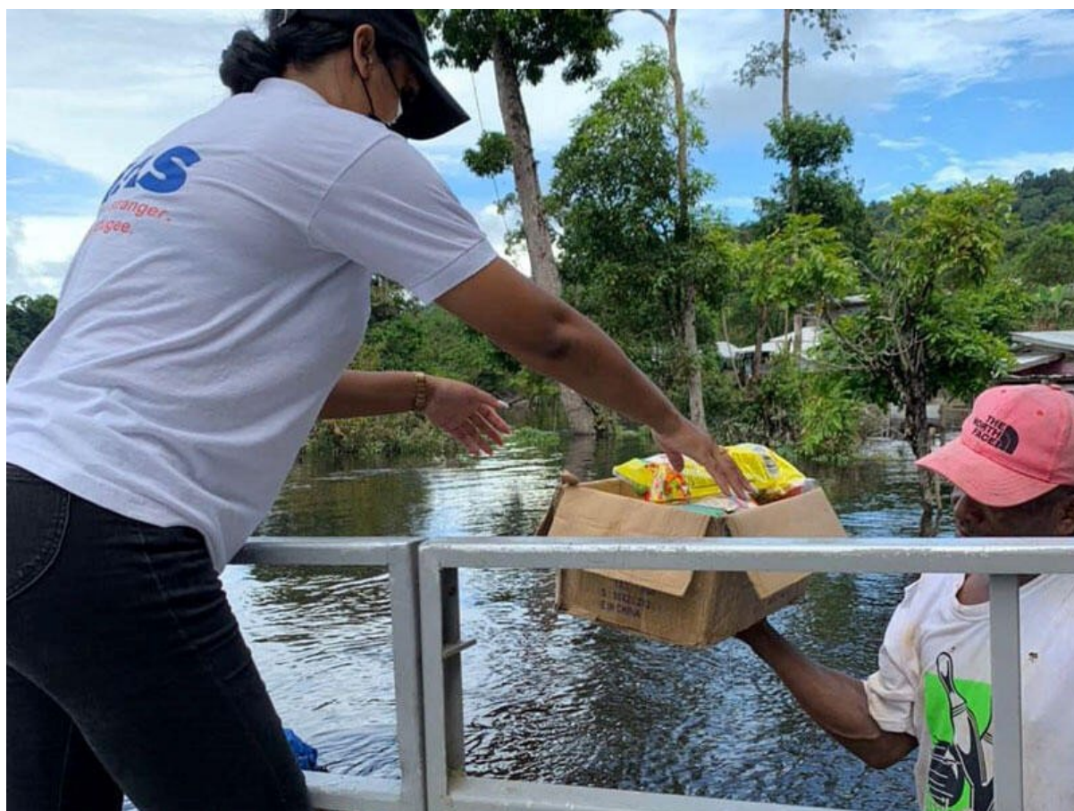
A HIAS officer hands a box of food items to an Issano Landing resident in June, 2021, after the area's worst flooding in 10 years. HIAS was able to collaborate with partners from the government to reach these distant villages.

HIAS Guyana's protection work provides Venezuelans with key information in Spanish about their rights and responsibilities, support with issuance and renewal of stay permits, and facilitating access to basic services like health and education. Following a needs assessment in 2021, HIAS Guyana established a presence in Mabaruma, with dedicated programming and staff to serve the Venezuelan indigenous Warao, who are particularly exposed to labor exploitation, malnutrition, lack of clean water, sanitation, and hygiene resources. HIAS has a dedicated protection case worker to support the community with registration, translation, and other protection needs.