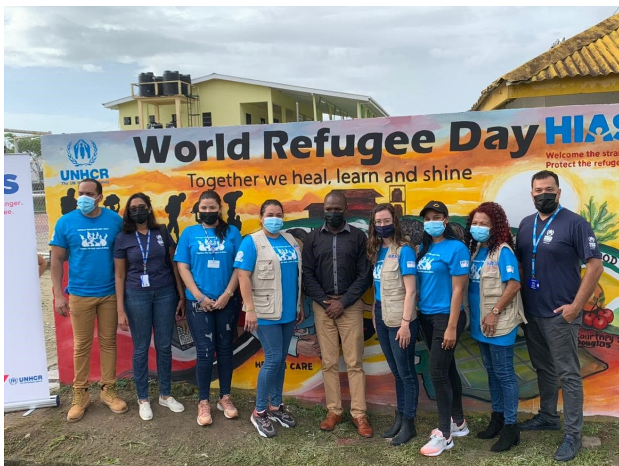
HIAS Guyana and UNHCR staff stand in front of the "World Refugee Day" mural in Bartica, made in honor of all refugees and displaced people from all over the world, especially honoring the Venezuelan community.

As HIAS' programs expand to meet new global needs, HIAS remains committed to delivering the highest quality of services to those it seeks to support and empower. To enable country teams to succeed and thrive, HIAS will invest new operational resources in our programs, processes, and people.