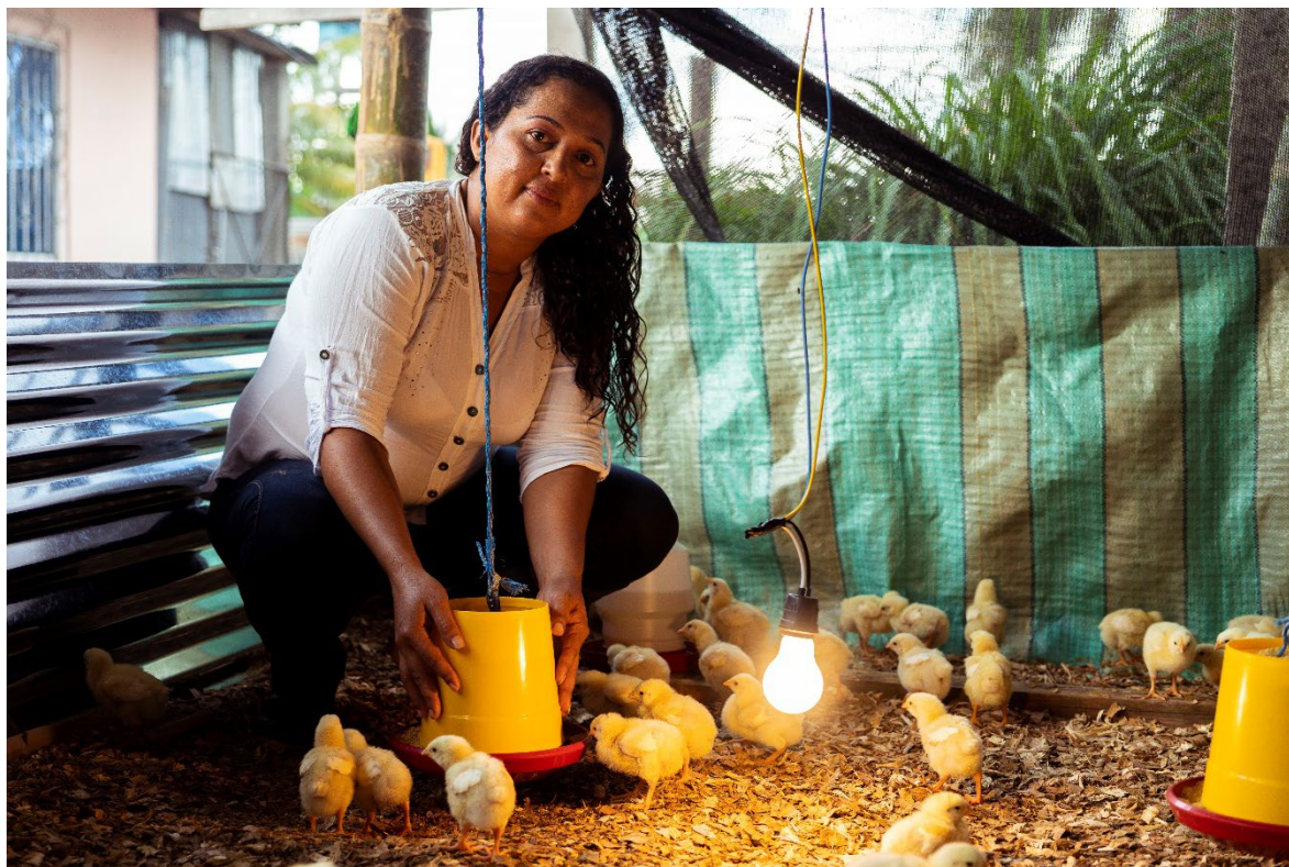
A Venezuelan refugee in Lago Agrio, supported by HIAS and UN Women with seed capital, was able to start her own business breeding chickens.

HIAS staff are subject to a robust Code of Conduct and set of internal policies, including PSEA, Non-Discrimination and Anti-Harassment, Conflict of Interest, Privacy, Whistleblowing, Security and Emergency Preparedness, Information Security, Data Breach, Finance and Accounting, as well as others relating to procurement, travel, and reimbursements.