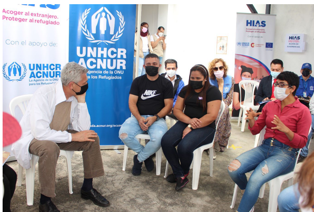
On June 22, 2021, during World Refugee Day commemoration events, UN High Commissioner for Refugees Filippo Grandi visited HIAS in Ibarra and met with Colombian and Venezuelan refugee families.

HIAS Ecuador's legal protection programs help refugees and asylum seekers access documentation, basic rights, and protection services through information sessions and local referrals. With the support of UNICEF and IOM, HIAS Ecuador also implements child protection programs for refugee children and teenagers. HIAS Ecuador helps families with at-risk children and unaccompanied or separated children, supporting them with cash-based assistance and access to education and other services. HIAS Ecuador tailors economic inclusion programming for adolescents transitioning into adulthood. HIAS Ecuador manages the two comprehensive support centers that UNICEF has established in Ecuador (in Tulcán and Manta), to provide families and children on the move with vital services, play-based programs, protection, and counselling in a single location. Also, with the support of UNICEF, HIAS Ecuador leads the implementation of Child Friendly Spaces throughout the country. Partnering with World Food Program, HIAS Ecuador provides recently arrived or at-risk families with food assistance. With cards or codes, refugee families can buy food that covers their nutritional needs at supermarkets across the country.