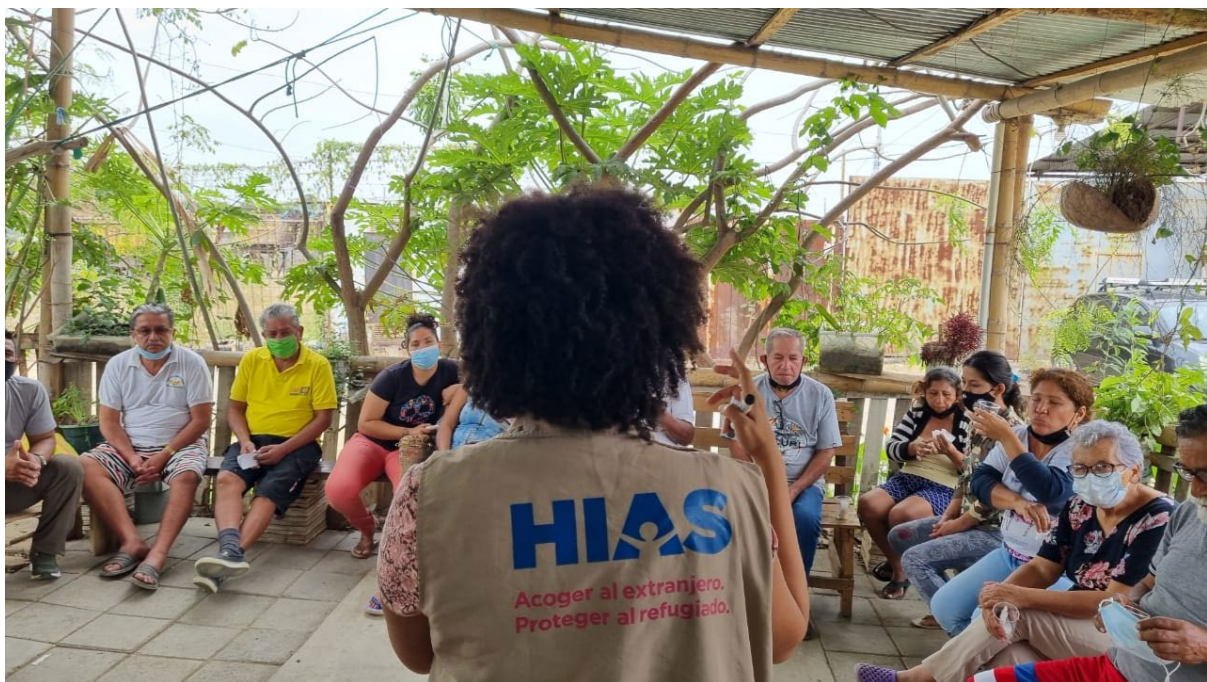
HIAS led a session of the Entrepreneurship School with a Gender Lens to promote social integration and social cohesion in Duran, a community that hosts a large number of refugees.

HIAS invests in the skills and capacity of staff worldwide, supporting a wide range of local, national, regional, and international trainings for staff. HIAS ensures that international staff have diversity, equity, inclusion, and justice (DEIJ) training. HIAS Ecuador's DEIJ approach is woven throughout operations at all levels. HIAS Ecuador recognizes that fostering safe, egalitarian, and respectful spaces for diversity including for persons with disabilities is critical to achieving organizational objectives. Going forward, HIAS Ecuador will be mapping its staff training and capacity building needs against programmatic objectives. HIAS Ecuador hopes to pursue new trainings for staff on social innovation to inform current and future programming.