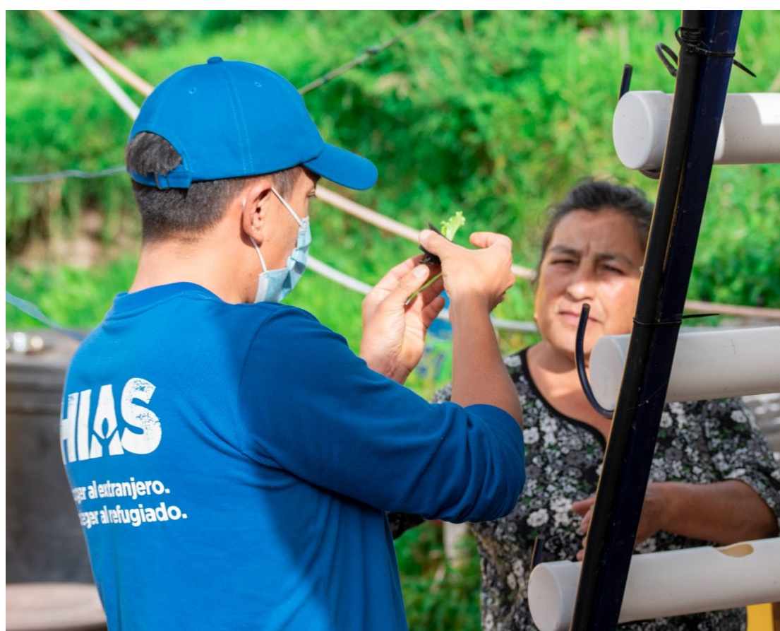
An Ecuadorian woman who lives along the northern border with Colombia learns about hydroponic crops as part of a business venture and community bank initiative. Together with another Ecuadorian, a Colombian refugee, and two Venezuelan refugees, she grows hydroponic lettuce.