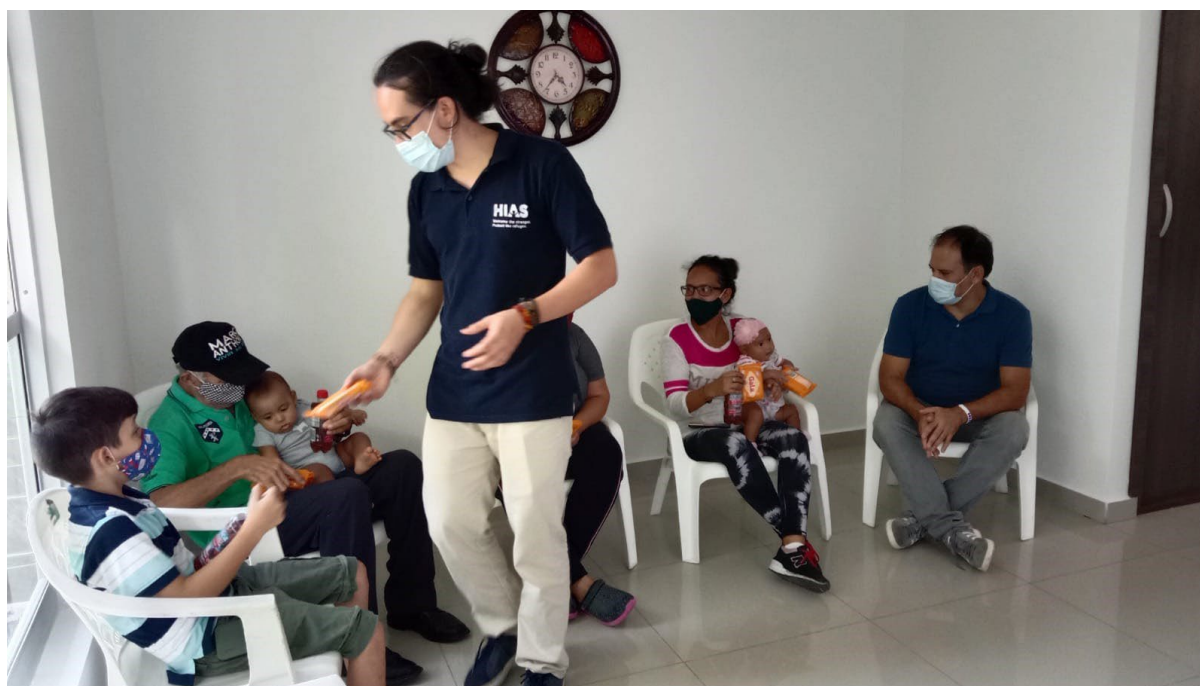
HIAS Colombia's Junior Protection and Accommodation officer providing refreshments to beneficiaries at the home of their Airbnb host in Barranquilla.

programming is designed and implemented in partnership with local communities and institutions to ensure sustainable impact.