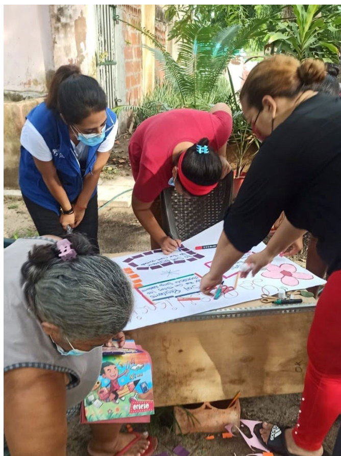
Refugees from Colombia and Venezuela in the Les Ferias community participating in an intercultural workshop to strengthen social ties and prevent xenophobia. The workshop addressed issues associated with prejudices about cultural differences, customs adopted from displacement, and how those experiences build resilience.

ensure both prevention and response to any reported incidents of SEA. HIAS applies a gender lens when analyzing, planning, and making decisions across all its operations, to ensure the safety, security, and wellbeing of the entire organization's staff.