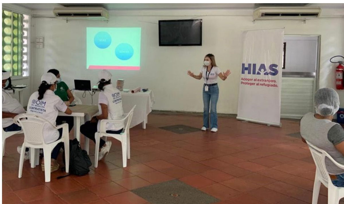
HIAS staff delivering an informative talk about GBV with IOM, the Social Ministry, and UNHCR in June of 2021.

Recognizing the critically important need to address the epidemic of GBV in the region, HIAS Colombia also looks forward to sharing progress and impact through the U.S. State Department/PRM-funded GBV regional program and hopes other donors will adopt this innovative funding mechanism to better address the scale of the GBV crisis in the region.