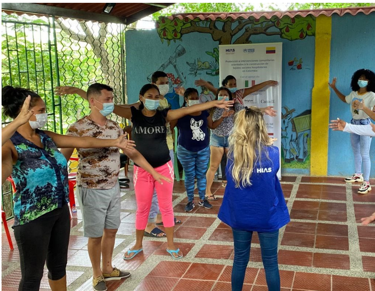
HIAS staff leading an ice-breaker activity during a Mental Health Workshop in the settlement of Villa Esperanza in September of 2021.

Globally, HIAS is rolling out a Digital Transformation Strategy to ensure that participants' personal information is digitally secured and protected. The strategy will also create one universal source of information and collaboration; ensure all organizational knowledge is standardized, digitized, organized, and discoverable; ensure data around inputs, outcomes, and impact is readily accessible; help employees collaborate on gathering and building resources on this information platform; and easily share and leverage data from partners and affiliates. HIAS will be providing annual refresher training to all country offices on IT tools and procedures.