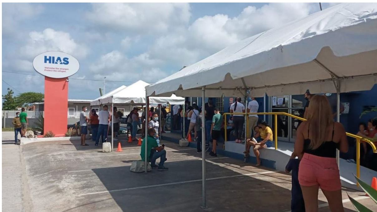
Vulnerable migrants and asylum seekers visit HIAS' office in Aruba to receive COVID-19 vaccinations in July, 2021.

In collaboration with the headquarters emergency team, HIAS Aruba will develop a preparedness strategy to respond appropriately to future emergencies in the region, whether natural disasters or major new displacement crises. HIAS Aruba is monitoring the potential for increased migration outflows from Haiti to the Bahamas and Turks and Caicos as well as the increasing number of Venezuelans arriving in Sint Maarten.