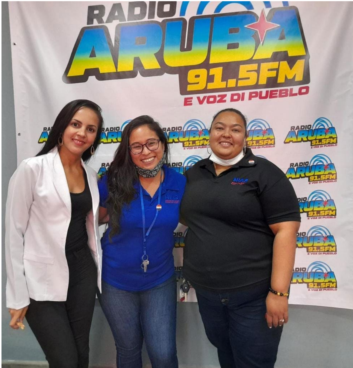
In September 2021, HIAS staff visited Radio Aruba to raise awareness and provide information about GBV.

HIAS invests in the skills and capacity of staff worldwide, supporting a wide range of local, national, regional, and international trainings for staff. HIAS ensures that international staff have diversity, equity, inclusion, and justice (DEIJ) training. Going forward, HIAS Aruba will be mapping its staff training and capacity building needs against programmatic objectives. HIAS Aruba has already identified the need for leadership and management training to support the continued professional development of team members. HIAS Aruba's growth in programming in the region will require changes to the staffing structure to meet new programmatic needs, provide opportunities for professional development, and position the team for further growth. HIAS Aruba will continue to review and adjust its overall human resources strategy and staffing plan, creating new positions as necessary and adjusting job descriptions to align staff skills, interest, and workload.