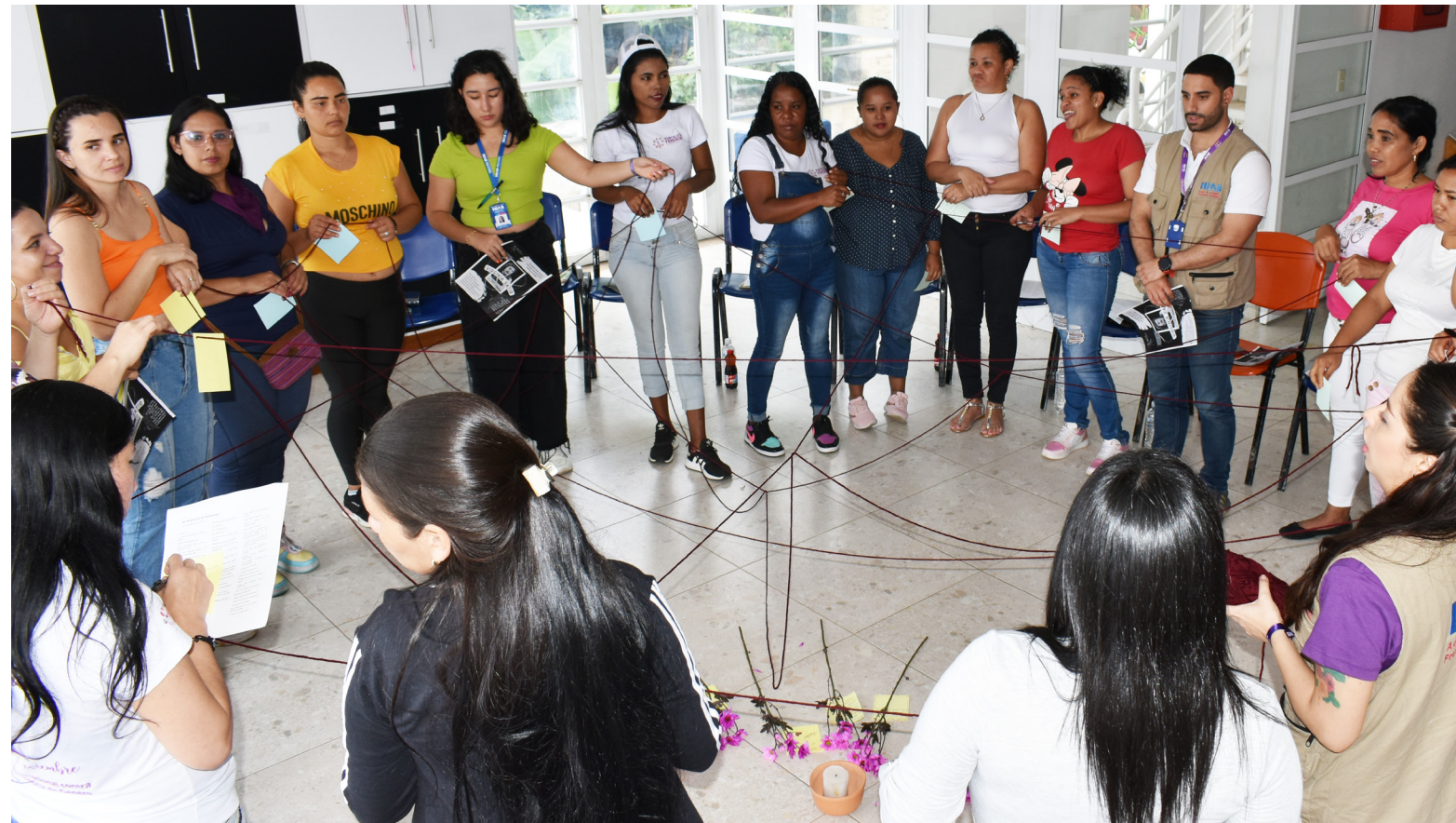
A gender-based violence prevention and response program in Colombia.

The outbreak of civil war in Sudan displaced 8.6 million people, including hundreds of thousands who sought refuge at camps in neighboring Chad. In 2023, HIAS Chad's Emergency Response team provided 108,795 Sudanese refugee households with cash-based transfers to purchase food and essential items. After the October 7 attack on Israel, HIAS launched an Israel Emergency Response to support the more than 250,000 people in Israel that became internally displaced. Between October and December, 11,475 internally displaced people received meals and NFI (non-food item) kits from HIAS and partner organizations. Finally, our Ukraine Emergency Response program harnessed relationships with partner organizations across Europe to provide Ukrainian refugees with vital services in 2023.