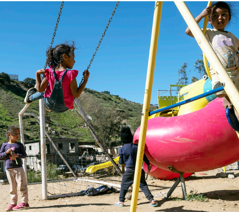
Migrant children play outside the Embajadores de Jesus migrant shelter in Tijuana, Baja California state, Mexico, on February 17, 2022.

Nearly one in five of all displaced people reside within the Latin America and Caribbean (LAC) region, where HIAS operates over 75 offices in 11 countries. Most seek protection within other LAC countries, such as Colombia, Peru, and Mexico. For those seeking asylum in Mexico, or those who intend to continue their journeys north to seek asylum in the U.S., HIAS operates eight offices providing legal, mental health, and gender-based violence (GBV) prevention programs.