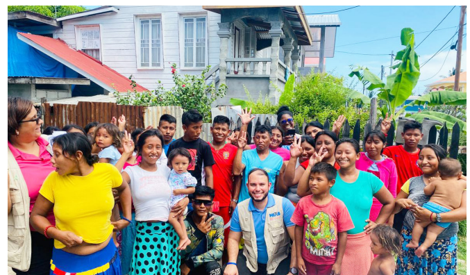
HIAS Guyana's legal protection and GBV teams visit an indigenous family of 48 members in Guyana. November 2, 2023.

The HIAS Gender and GBV team is composed of technical advisors, specialists, coordinators, and field teams with broad global, regional, and country-specific experience. The team sets and guides HIAS' strategy, maintains a gender lens across interventions, and provides technical support including capacity strengthening and knowledge building to ensure our programming aligns with international standards, founding principles, and best practices.