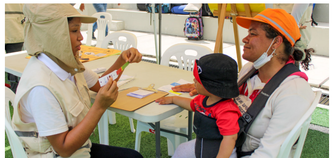
Nutrition screening for migrant children in Peru.

The HIAS FSN Team is comprised of technical experts with broad global, regional, and country-specific experience. The team sets and guides HIAS' strategy for FSN and provides technical support, including capacity strengthening and knowledge building, to ensure our programming aligns with international standards, founding principles, and best practices.