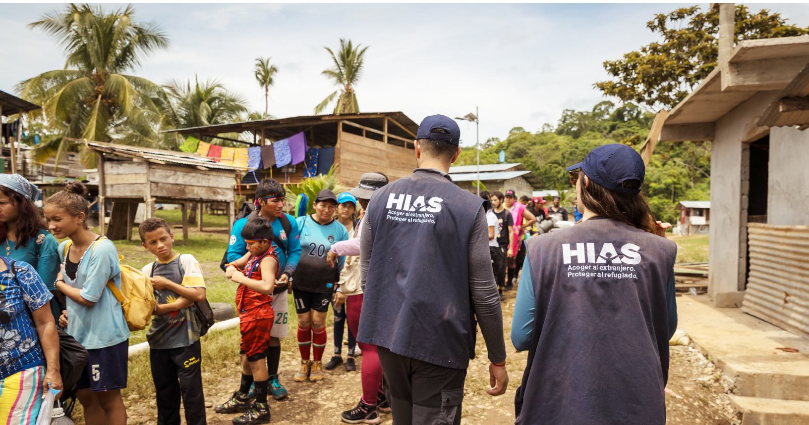
Representatives from HIAS engage with members of the Embera Wounaan indigenous community and newly arrived migrants at their initial destination in Bajo Chiquito, Darién province, Panama, on August 2, 2023, following their passage through the Darién Gap.

Welcome the stranger. Protect the refugee.