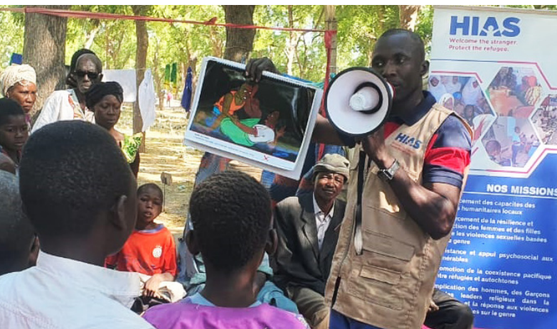
A HIAS staffer addresses people displaced by flooding in N'Djamena, Chad on November 10, 2022.