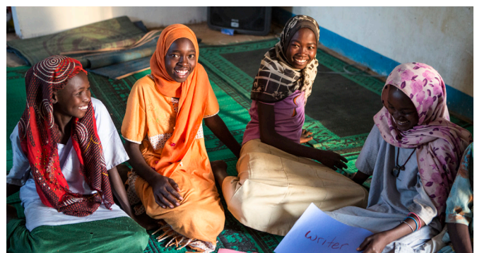
Darfuri refugees in Farchana, Chad.

The HIAS Child Protection team is composed of technical advisors, specialists, coordinators, and field teams with broad global, regional, and country-specific experience. The team sets and guides HIAS' strategy for Child Protection and provides technical support, including capacity strengthening and knowledge building, to ensure our programming aligns with international standards, founding principles, and best practices.