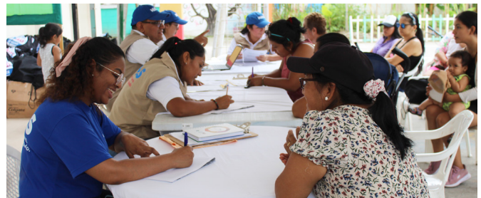
People receive hygiene kits and cash-based assistance in Pasaje, Ecuador.

HIAS' Cash and Voucher Assistance (CVA) Team is composed of technical advisors, specialists, coordinators, and field teams with broad global, regional, and country-specific experience. The team sets and guides HIAS' strategy for the CVA modality and provides technical support, including capacity strengthening and knowledge building, to ensure our programming aligns with international standards, founding principles, and best practices.